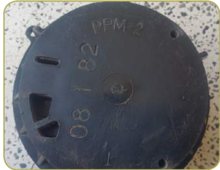
Anti-personnel mine PPM2, removed from Al-Gahmlyya, and other neighborhoods, December 2016

Abdulkareem Abdu Haidar , a paramedic in a military unit said to Rasd monitors that while the legitimate army was attacking Madrat village, 300m far from the soap and ghee factory in Taiz Hodiedah road, a number of mines were detonated injuring 4 fighters.