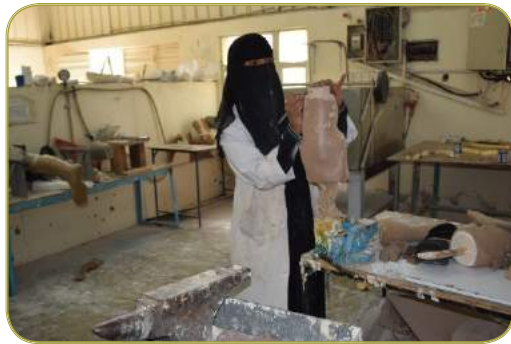
Physician at the Artificial Limbs Center, Taiz, December 2017