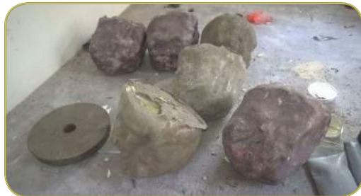
Booby-trap disguised as rocks, removed from Bazar’a, November 2016

“the estimated number of anti-personnel and anti-vehicles mines that we’ve removed are about 300 mines, the locally made IEDs are about 1000 in different types and sizes”, he added. Alsaqqaf noted that in AL-Gahmlyah