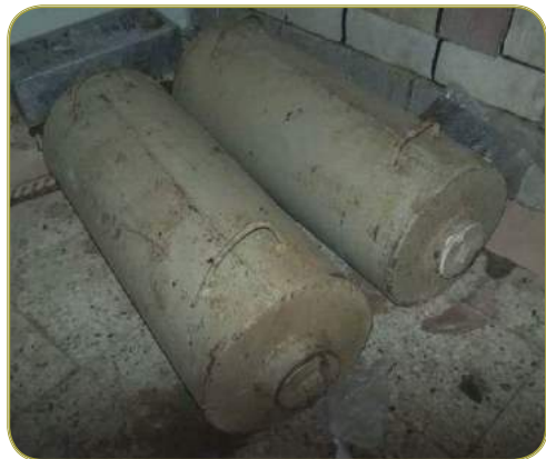
Local made TNT IED, 54 kg. found in a mine producing plant in Bazara'a neighborhood, Taiz

Rasd Coalition has monitored and documented the killing of 189 civilians and military individuals, 107 of them are caused by anti-personnel mines, and 83 by uncontrolled anti-vehicles mines, including