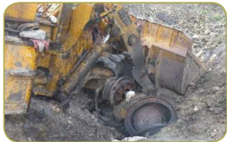
2017 Loader/Shovel destroyed by anti-vehicle mine, May

Houthis deliberately Laying mines in the public roads to hinder people movements, in Adhabab road, linking between Taiz and Aden, which was under Houthis control before August