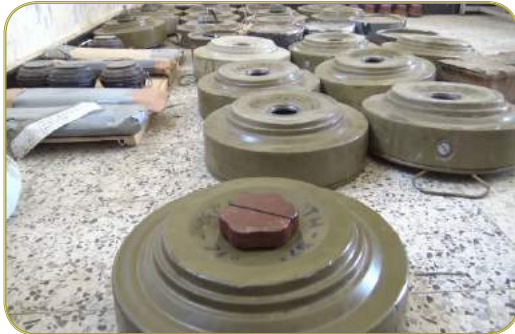
Anti-vehicle mines TM57, removed from Najd Qaseem, main road, Almisrakh January 2016

TM47, TM57, TM46, as well as booby-traps and IEDs weighted up to 56kg”.